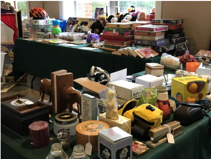
Some of the “treasures” from our Church Fair.

Some of the leftover items were donated to a local charity, and the better ones were stored, to be offered at a future fair. We had great fun and fellowship, and that counts for a lot.