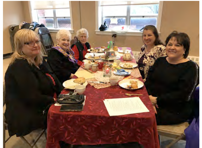
Some church ladies enjoying tea time.